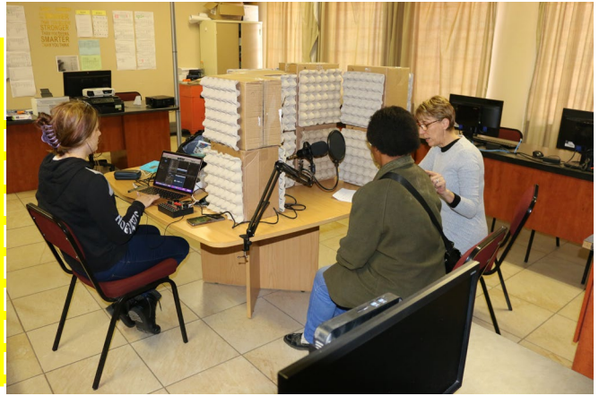
The podcast recording session