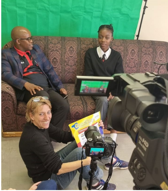
Behind-the-scenes for the school's talk show.