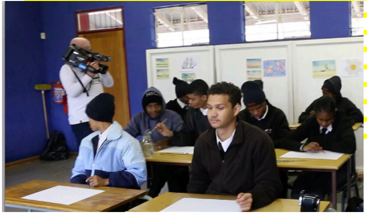
Behind-the-scenes of "Envy".