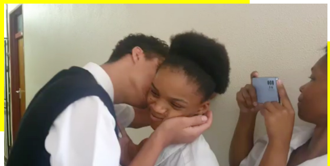
Every angle counts.