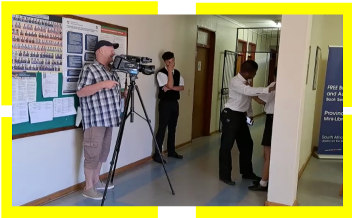
Director takes charge!